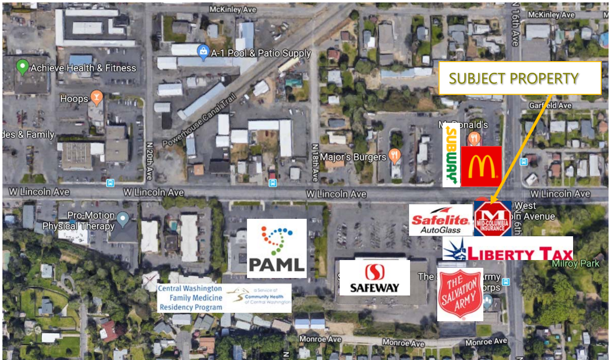
1602 West Lincoln Avenue

No warranty or representation, expressed or implied, is made as to the accuracy of information contained herein, including all attachments referenced, and same is submitted subject to errors, omission, change of price, rental or other conditions and withdrawal without notice. Buyer and his/her agent are responsible for independently verifying all presented information.