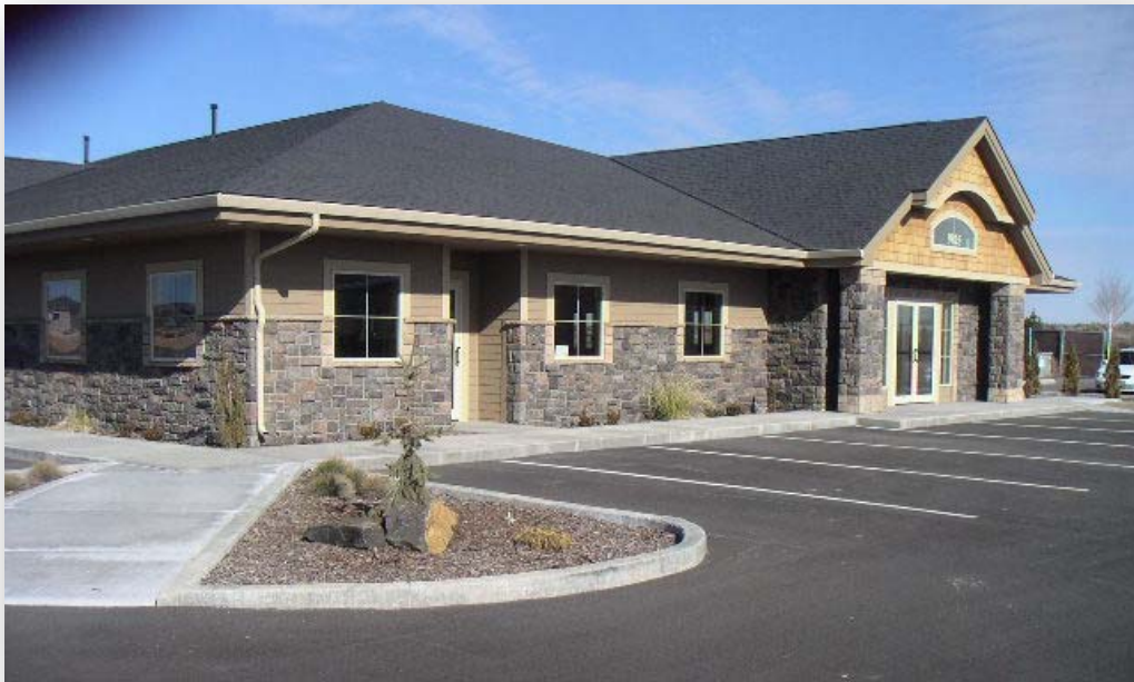
9825 Sandifur Parkway, Suite `C